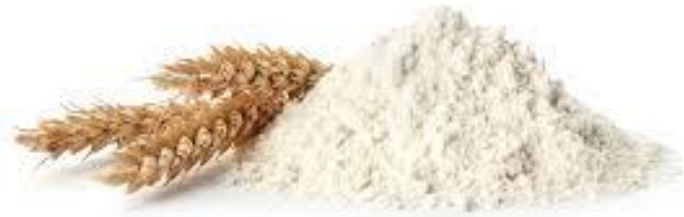
MATURE WHEAT PLANT