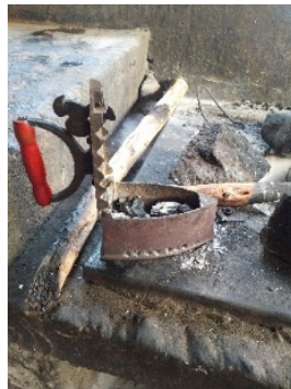
and the staff use the iron