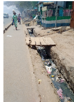
a street in freetown