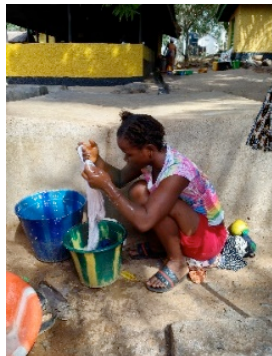
The children do their own washing